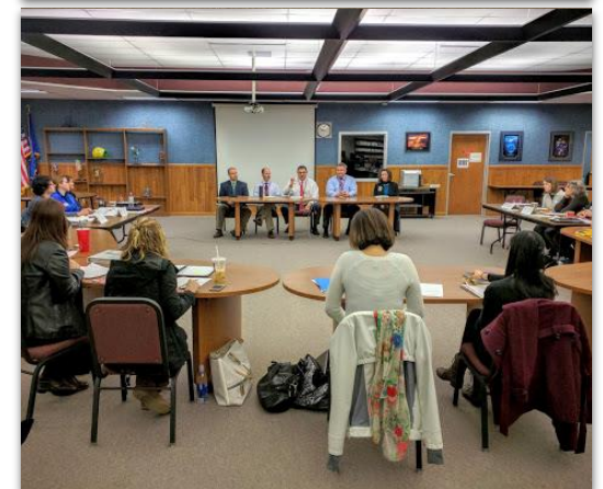
Class XVI learning from a panel of experts